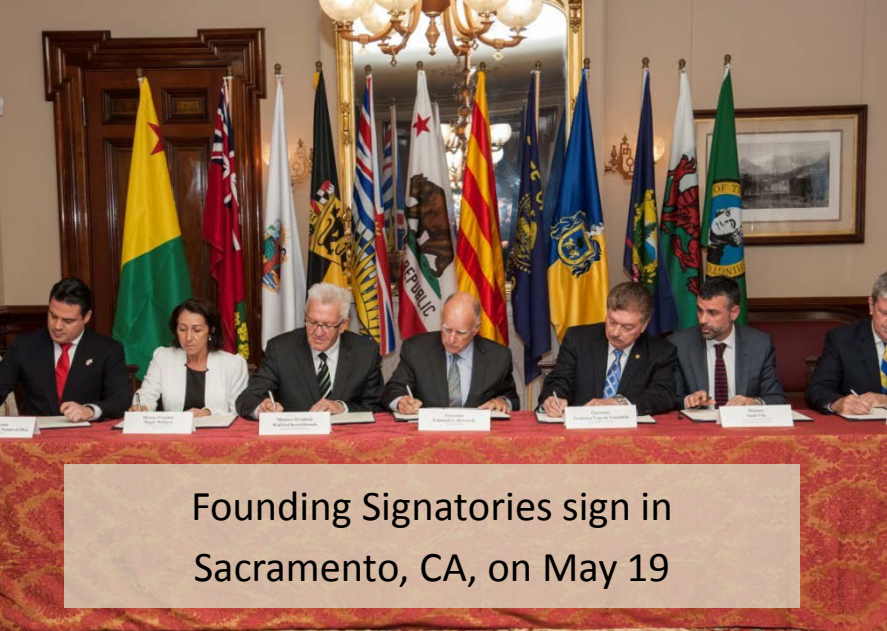
Founding Signatories sign in Sacramento, CA, on May 19