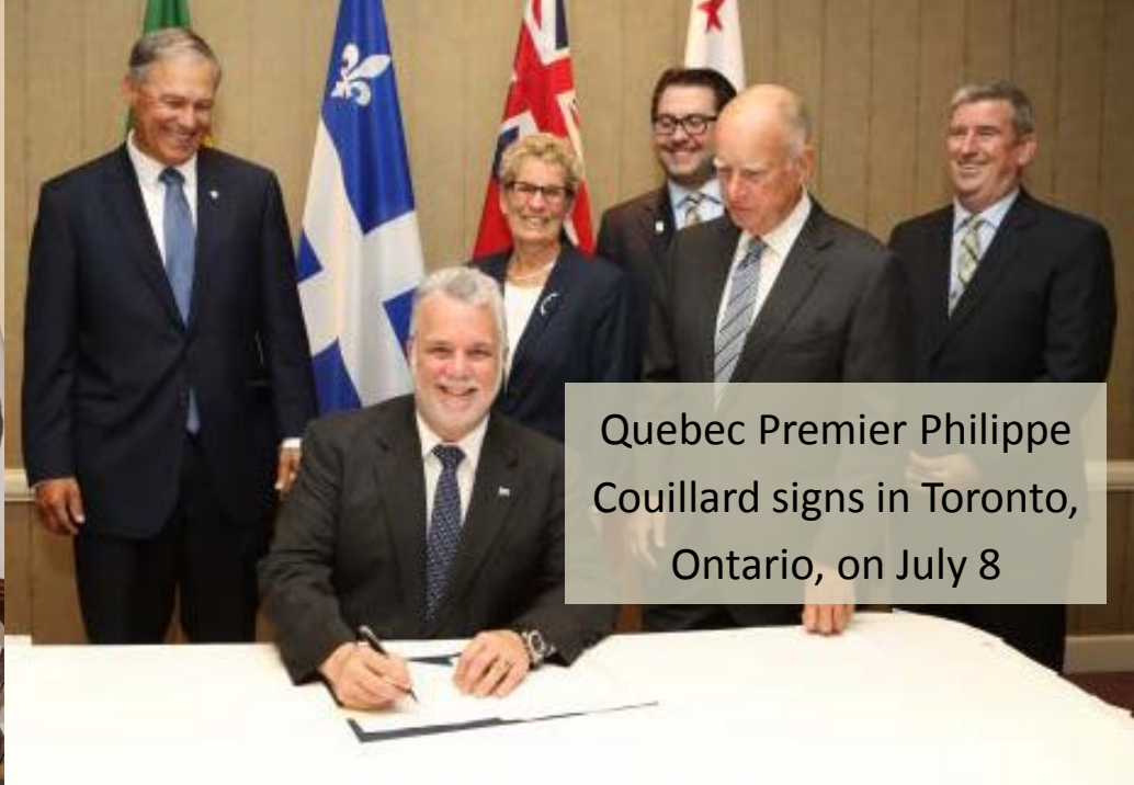
Quebec Premier Philippe Couillard signs in Toronto, Ontario, on July 8